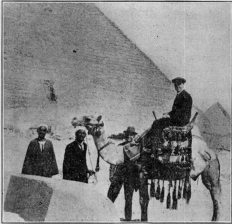
George Washington of Egypt